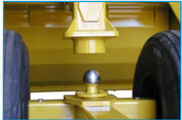
Large machined 4" ball for strength and smooth swivel of dolly.