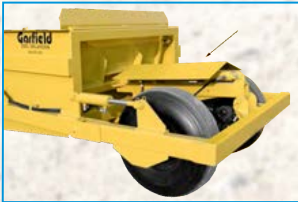
Safety shield protects ejector cylinders, rails, and guide rollers.