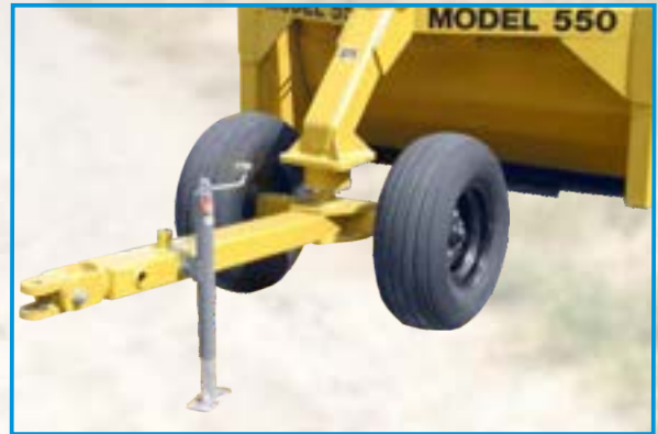
8 ply tires are 11" wide for longer life and better flotation.