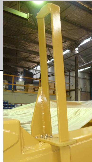
Depth gauge and grease points for bearing lubrication