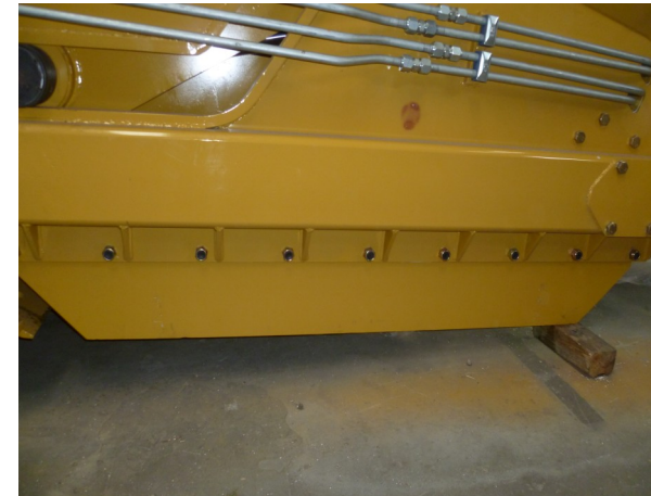
Replaceable wing extensions