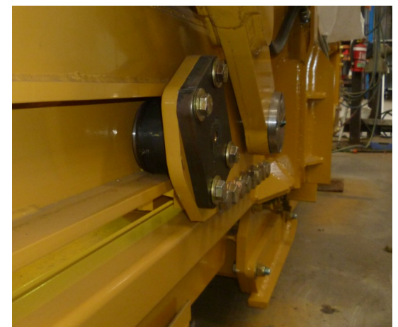
Hardened greaseable ejector bearings