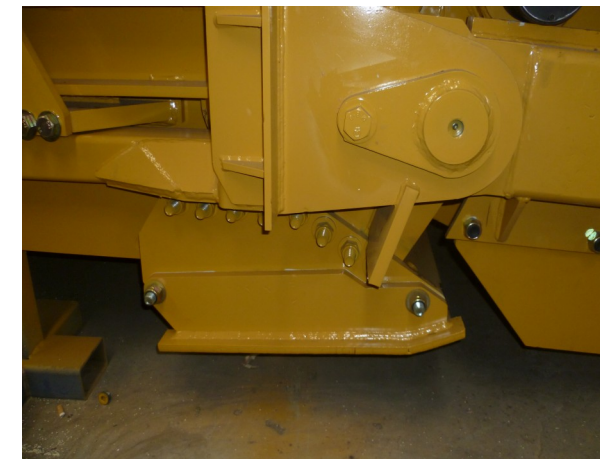
Replaceable bolts on skids