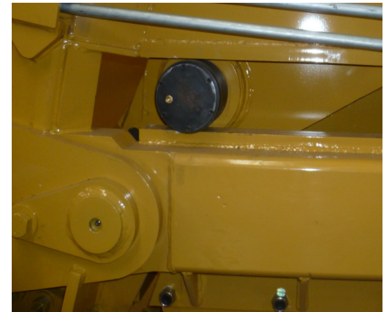
Sealed for life hardened Apron bearings

Hodgco Cushion Hitch System $11,000 plus gst Draw Bar Ball Connector $4,250 plus gst