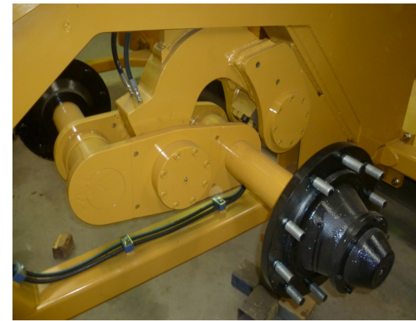
Walking Beam and Cross Leveller with oil filled hub