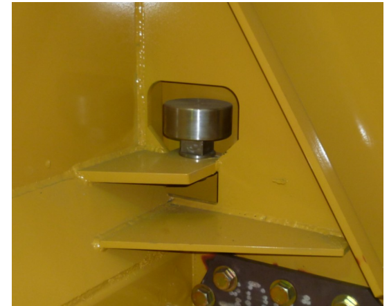
Adjustable Side rollers on ejector apron