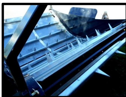
Replaceable rust resistant, zinc plated feed-out bars. Zinc plated tray with feed-out extensions, to feed beyond the wheels.