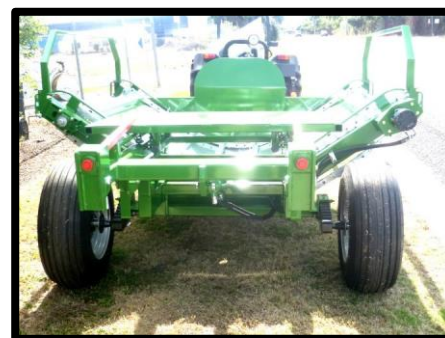
Large 1900mm absolute wheel width with unique independent arm suspension and flotation tyres.