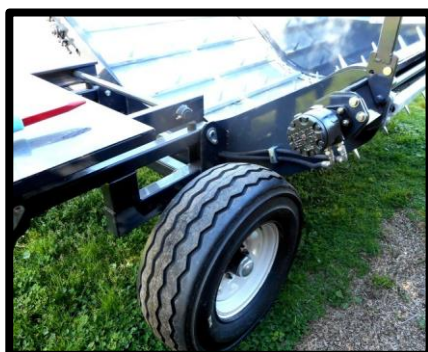
Protected rear mounted bi-directional high torque, 400cc motor with high torque drive coupler.