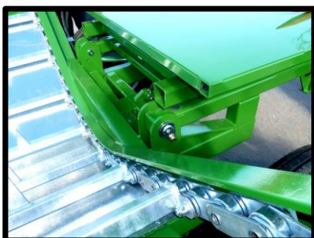
Market leading, high strength, rust resistant, 12000LB, zinc plated chain.