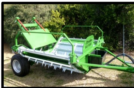
2 pack epoxy paint, in a variety of tractor paint colours.